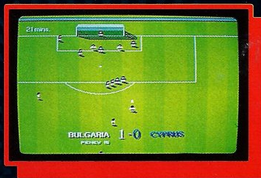
AMIGA VERSION SHOWN