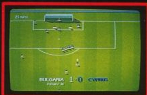
AMIGA VERSION SHOWN